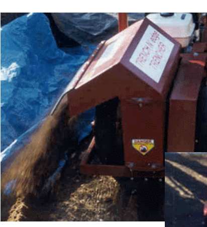
Dual side discharge, sends soil into or out of flower bed, from either direction