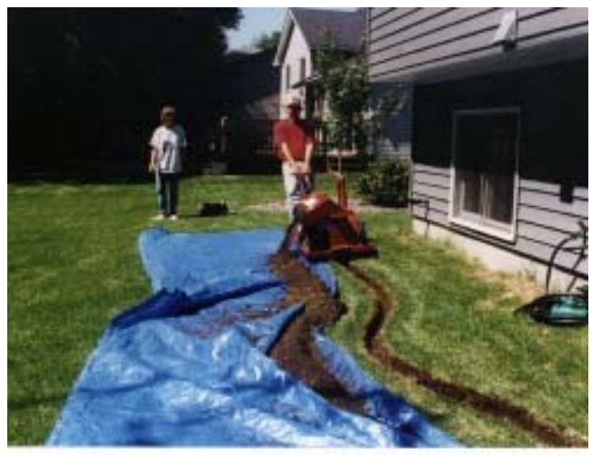
Dual-side discharge into or out of bed so material won't ruin existing lawns or planting beds.