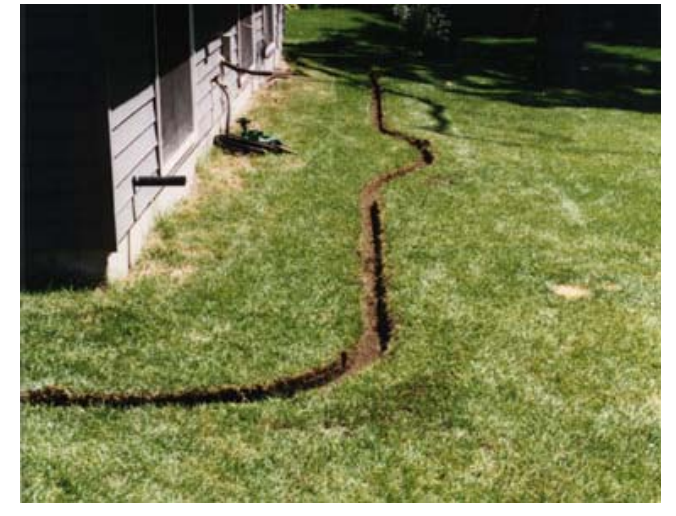
No clean-up costs means increased profits and happy customers.

For Smooth Curves and Less Work, Call 800-4-T-EDGER, (800-483-3437). For the Edge, Inc., 8028 Hill Trail North, Lake Elmo, MN 55042-9534 Phone (651) 777-7923, Fax (651) 770-9430 www.trenchnedge.com US Patent Number US05964049